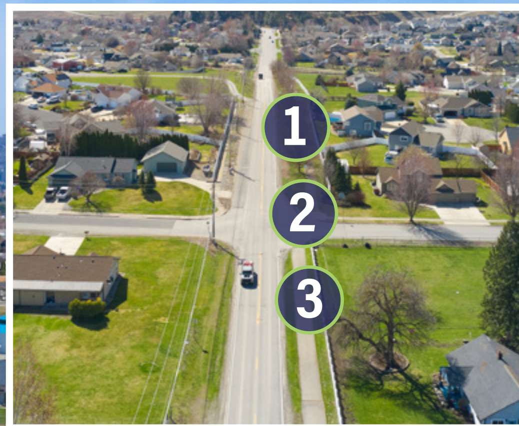
▲ Barker Road south of I-90