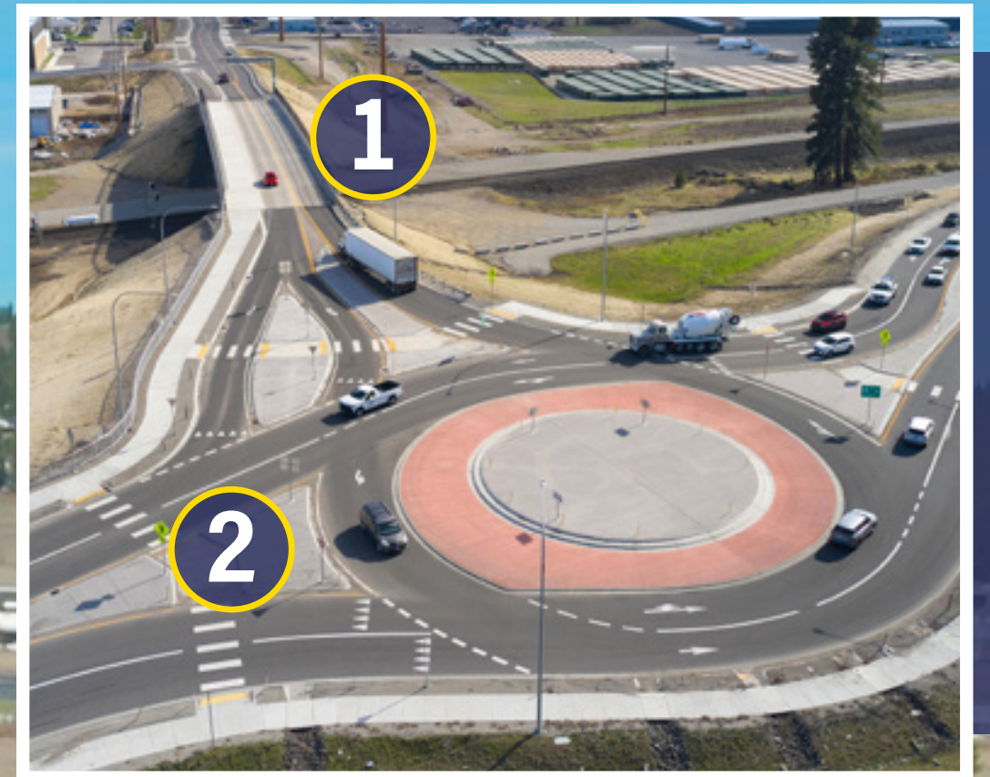
▶ Barker Road and SR-290 (facing south)